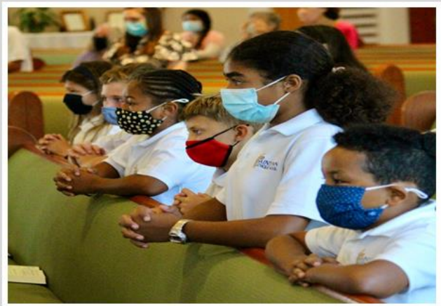
Saint Ann School Students attend Mass.

The subcommittees and the contact information for each subcommittee are as follows: